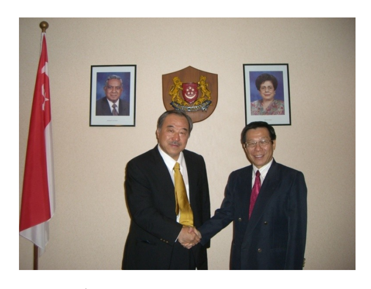
Mr. Mah Bow Tan Minister for National Development Republic of Singapore