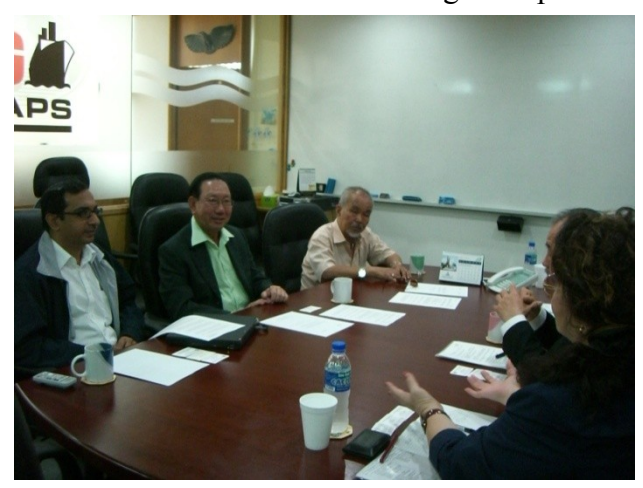
Meeting on Apr. 2009